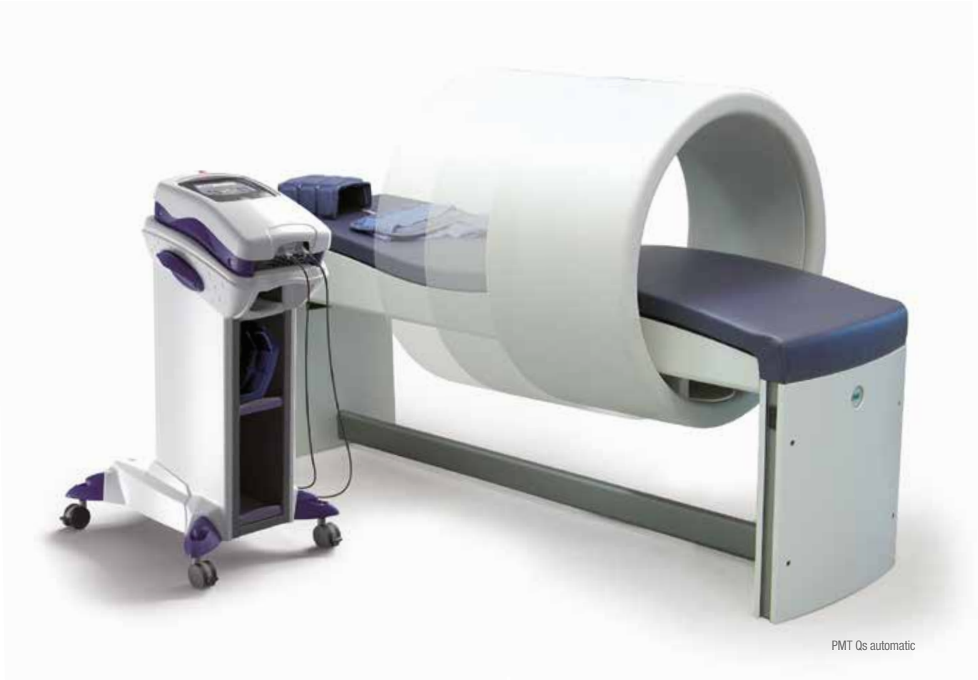
PMT Qs automatic