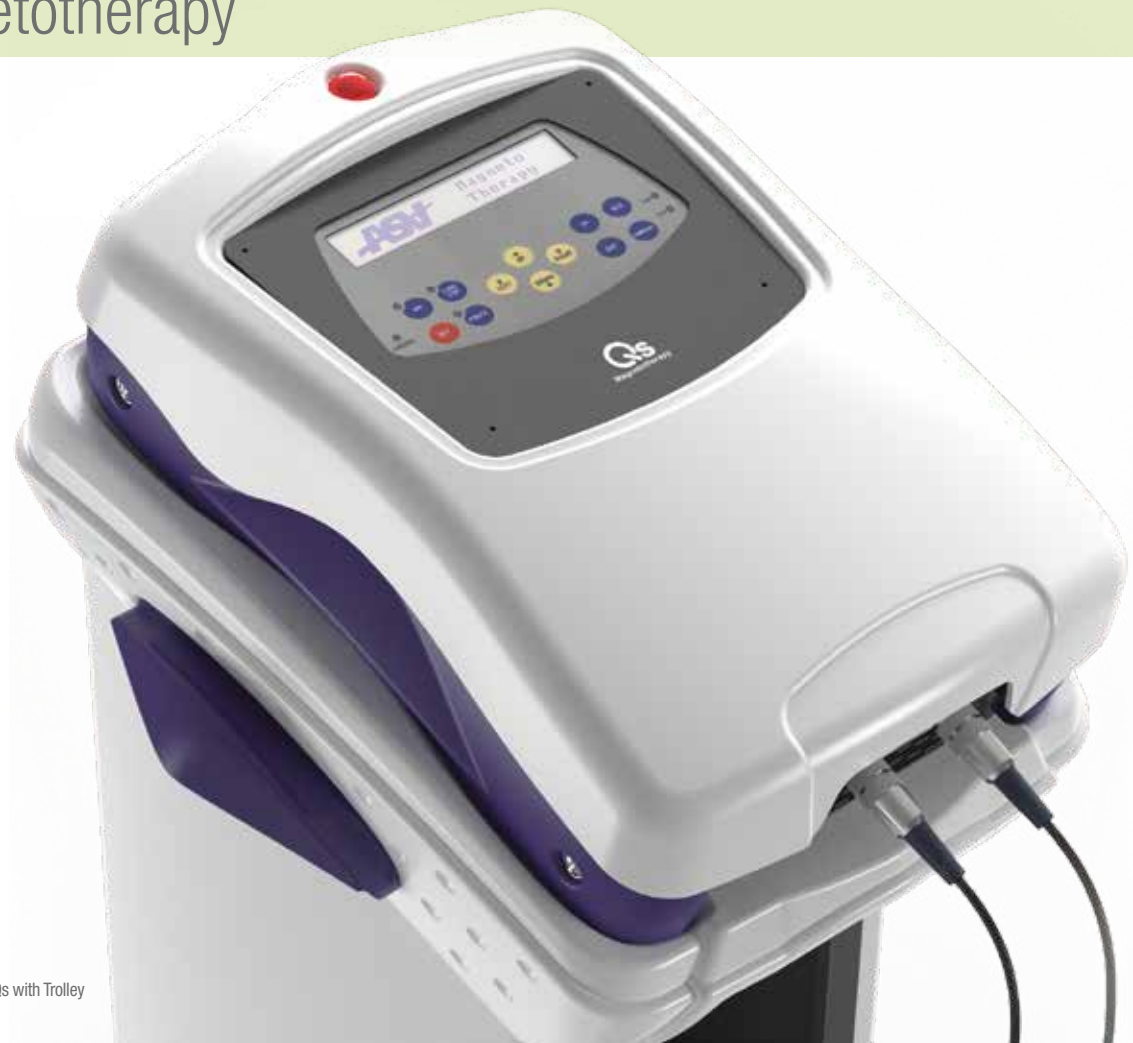
Generator PMT Qs with Trolley

• Power supply: 100-240V~ 50-60Hz 850 VA